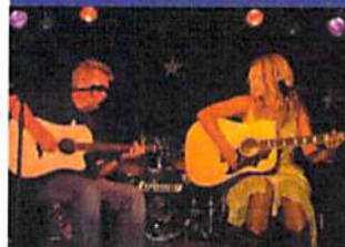
Nashville Nightlife Dinner Theater.