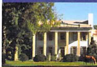
Belle Meade Plantation.