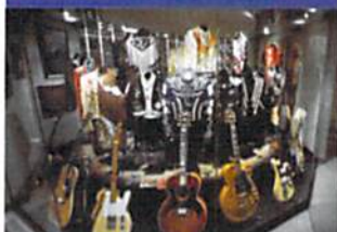
Country Music Hall of Fame.