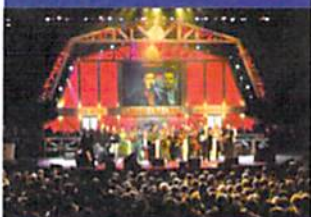
Famous Grand Ole Opry.

Departure: Michigan City Senior Center, 2 On the Lake, Michigan City, IN @ 8 am